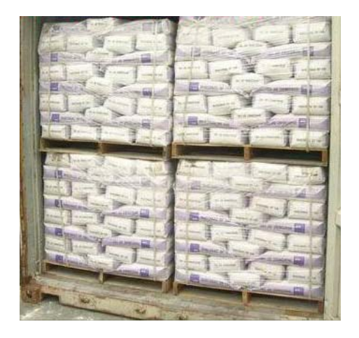
Figure 1: Package of silica fume in factory

Also, addition of silica fume decreases the workability of the mix. Silica fume can solve problems, because of its very loose bulk density and fine particles [5]. However, it causes other problem such as stickiness, bridging in storage silos, and clogging of the pneumatic transport equipment. The Package of silica fume in factory is shown in the Figure 1.