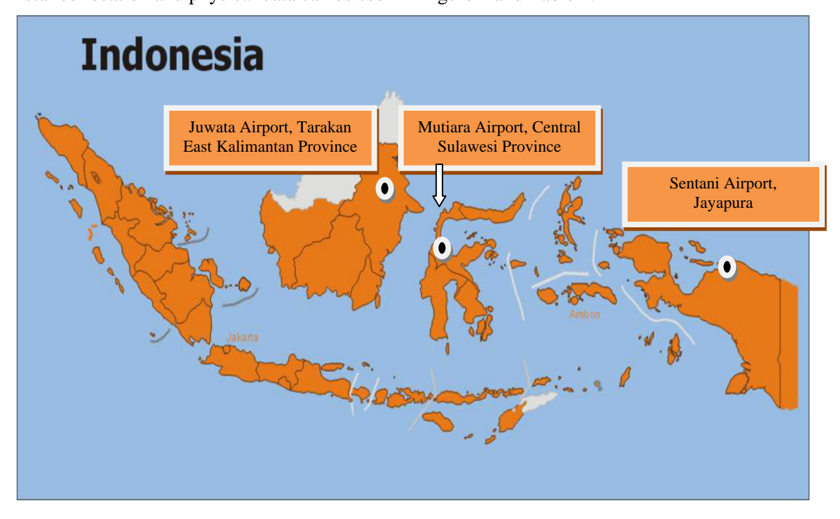
Figure 2. Map of Airport Location

Airport location surveyed consists of Sentani Airport, Jayapura, Papua Province; Mutiara Airport Palu, Central Sulawesi Province; and Juwata Airport, Tarakan, East Kalimantan Province. Detailed location and physical data can be seen in Figure 2 and Table 2.