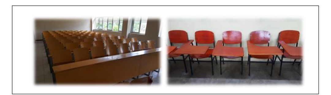
Figure 2: Design of seats in Ardhi University's lecture rooms

Although the findings show that there are no proper standards for classrooms at the campus university level; they have no implications on the utilization rates because students are not affected by the space provided.