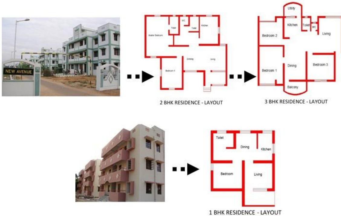
Fig. 2 - Building Layouts

A questionnaire-based survey was administered in all 144 residences to collect information on the number of occupants, elders, working adults, presence and the age of children; the number of air-conditioners and heaters; space occupancy patterns; hours of use of air-conditioners and heaters; family's weekend activities and occupants' behaviour during discomfort hours (keeping the windows open with fans switched on; the habit and frequency of using fans/ air-conditioners and fans and air-conditioners together). The details of family composition and the number and hours of use of appliances for the three types of residences are presented in Table 2.