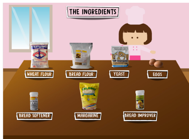
Fig. 1 - List of ingredients in iBakery

iBakery is an electronic courseware or an application which adapts the step-by-step instructions for baking. It is developed to help the Autistic students from Sekolah Menengah Bukit Katil to learn about baking in a better learning platform interactively. iBakery provides the complete steps of baking a sausage bun. There are three main sections in iBakery; Ingredients and Baking Tools, How to Use the Tools, and Steps. As an additional feature, there is a simple quiz at the end of the courseware. It consists few questions related to things used in the steps with multiple choice answers.