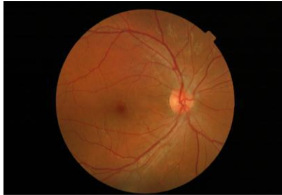
Fig. 1- Original Image

Figure 1 shows the original image. Meanwhile Figure 2 shows the resulting image after the optic disc removal.