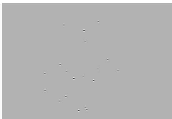
Fig. 3 - Hessian matrix 2D