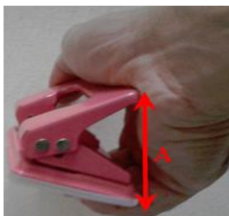
Fig. 4 - Grip span (A)

The grip span (Fig. 4) is the inter distance of two handles of a hand-operated product. Food tongs, pliers and tweezers are examples of hand-operated product which designed with two handles to ease tasks associated with gripping, cutting and crushing. To operate these products, a user has to exert a forceful squeezing action across two pivoting handles. An appropriate grip span allows senior citizens to hold the handles firmly thus generate maximum force for gripping. On the other hand, too large grip span results in stress in the flexor tendons consequently affect the grip strength. Similarly, if the span is too small then the force that can be applied by the hands decreases. Optimum grip spans for senior citizens are given in Table 4.