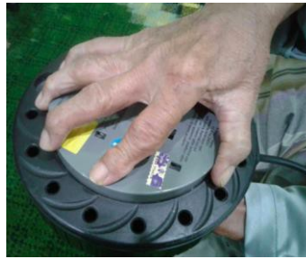
Fig. 5: Senior citizen with hand arthritis having difficulty in rotating cable drum

arthritis having difficulty to rotate a large diameter of power cable drum. Table 5 presents the existing size of several hand-operated products.