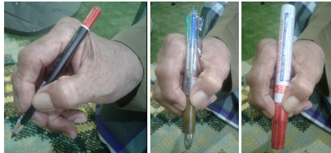
Fig. 8 - Gripping of three different handle diameters

accurate to design handle length for senior citizens. Very few studies reported the palm breadth dimension (Table 10) even though a lot of studies have been conducted on anthropometry of senior citizens. This indicates further study is needed to establish a comprehensive database of hand anthropometry of senior citizens. As an alternative to determine the handle length, the palm breadth of senior citizen can be estimated based on the palm breadth of young adults (95th percentile). Using this estimation, it will results in longer handle length, but it can accommodate everyone including senior citizens. Table 9 tabulates recommended handle length for senior citizens based on palm breadth.