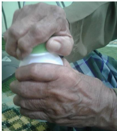
Fig. 6 – Applying torque to rotate the bottle closure

The amount force and torque that a human can exert to tighten or loosen any hand-operated product is greatly influenced by the age. Torque is a rotational force required to twist the cap or part of a product, for instance, tightening or loosening a jar lid (Fig. 6). Senior citizens demonstrated poor control of finger forces in gripping and manipulating hand-operated objects due to decline in dexterous behavior [92-93]. The human strength starts to decrease enormously when the age more than 60 years old [94]. It was found that the peel force of senior citizens aged over 65 years was generally lower than the young adults [95]. Voorbij and Steenbekkers [96] performed a study on wrist torque among senior citizens whom over 50 years old. Their study suggested that the required torque for opening a 66 mm diameter jar lid should be limited to 2 Nm for senior citizens. A study suggested that medicine containers with child resistant closure (CRC) require torque of 0.5 Nm to ease senior citizens to open them [82]. Notenboom [97] observed that breaking scored tablets by hand is less successful in senior citizens compared to youngsters. Another study pointed that there is a fair relationship between grip strength and the forces used to open the large prescription medicine bottle and to operate the aerosol spray can performed by senior citizens. Table 7 provides key findings of previous studies related to torque needed to operate hand-operated products.