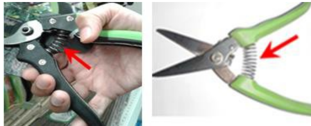
Fig. 7 - Spring is used in operating a pruner

effect on handle operation. The negative effect of spring might be due to an additional effort required against the spring force. Meanwhile the positive effect could be due to assistance of releasing the handles. Dayanidhi [103] in their study applied a helical compression spring (stiffness = 0.86 N/cm) to measure pinch strength and strength–dexterity in a cross-sectional population of 98 participants (aged 18 to 89 years old). The study found that the poorest hand manipulation ability occurred among individuals older than 65 years. This is due to deterioration of neuromuscular control over the age. Selection of spring stiffness is crucial in designing a hand-operated product, however, very minimal studies been performed to investigate appropriate stiffness of spring for senior citizen users. Table 8 lists the key findings of previous studies related to spring stiffness.