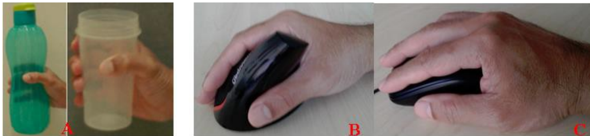
Fig. 3 - Tapered containers (A) for better grip. Vertical mouse (B) allows neutral posture, but not horizontal mouse (C)

The shape, grip span and size of hand-operated products influence the ability of senior citizens for gripping activities. Shape defines the form and geometry of product or part of the product. Shape is crucial because it is intimately related to grip function. As shown in Fig. 3, water containers with taper shape allow better grip and would not slip easily. Vertical computer mouse promotes neutral wrist posture compared to horizontal mouse (Fig. 3). Another example a pencil is designed in hexagonal to ease grip and can prevent from rolling. Another function of shape is to support the wrist torque strength. Previous studies pointed that rectangular and triangular handle shapes were most favorable to acquire greater torque exertion [69-70]. An experimental work tested grasped spherical surfaces varied from concave with radius of 20 mm to convex with radius of 5 mm. It was proved that there is a correlation between shape and grip force during object manipulation - more convex the curvature, the higher the applied grip force [71]. Table 3 tabulates key findings related to shape of hand-operated products.