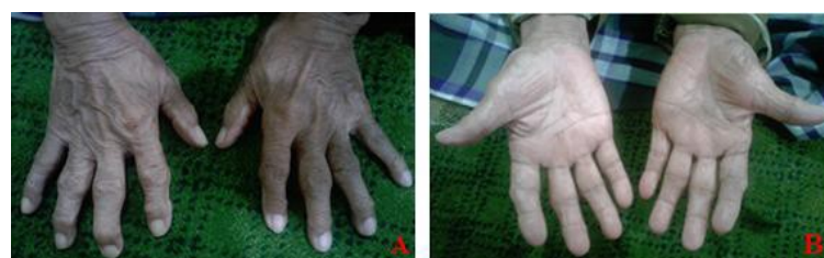
Fig. 1 - Hand with arthritis: Posterior (A), Anterior (B)