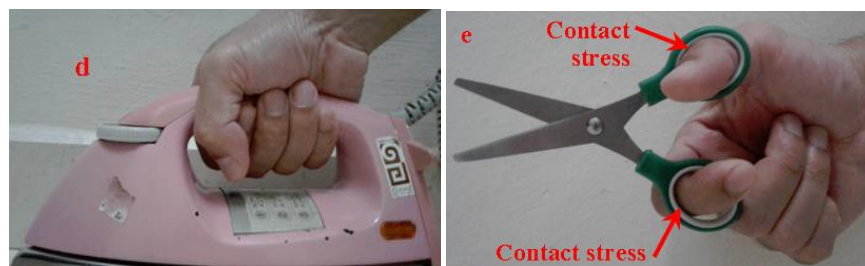
Fig. 11 – Good clearance around the handle (d) and contact stress due to insufficient clearance (e)