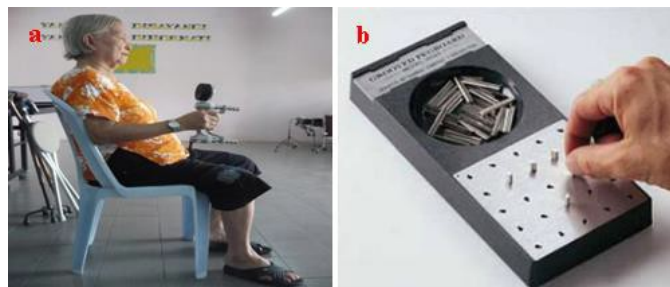
Fig. 12 - Grip strength measurement (a) [110]. Dexterity test using grooved peg-board (b) (Lafayette Instrument, USA)

Designing hand-operated products for senior citizens requires knowledge from multiple engineering fields such as ergonomics (e.g. body dimension and physical strength), manufacturability, maintenance and services, aesthetics, hygiene, affordability, ease of storage and transportation for greater user experience and better usability. Application of universal design principles such as low physical effort to use the product would be appreciated by the senior citizens [131]. In addition, hand-operated tools should consider ergonomics design principles to meet physical dimension and capabilities of senior citizens. Some examples include proper handle to allow wrist stays in its neutral posture [132], handhold to minimize exertion of the hands while lifting a heavy bucket, cushioned and contoured grip handle to minimize contact pressure and slippage, and sufficient clearance between hand and openings. Design information such as gripping force which measured by hydraulic gauge (Fig. 12a) and dexterity test using peg-board (Fig. 12b) will certainly support designers to deploy appropriate force exertion and to study finger motor coordination when designing hand-operated products for senior citizens use [133-135].