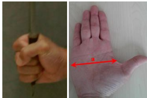
Fig. 9 - Handle length follows the palm breadth (a)