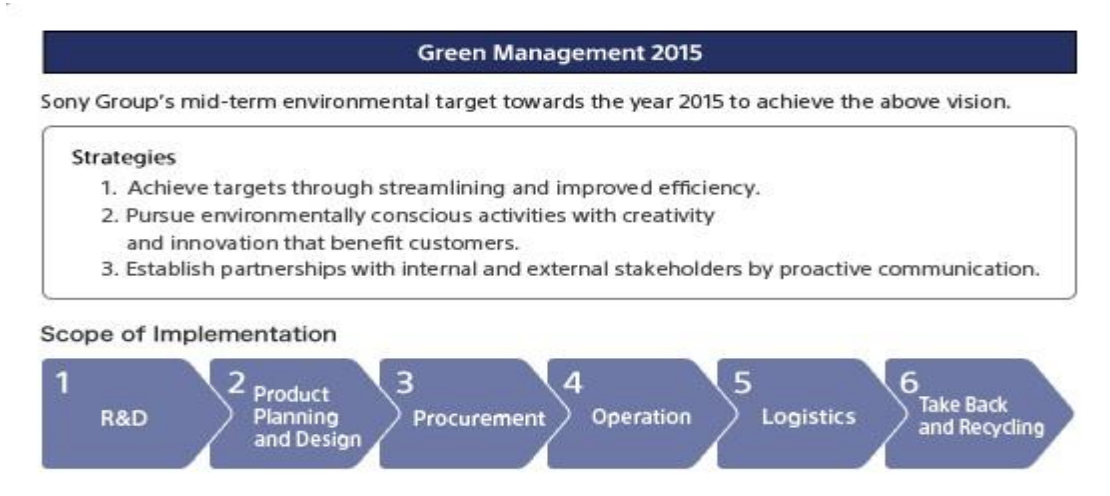
Figure 4.1 : Sony basic policies for Achieving Green Management 2015

According to Figure 4.1 secondary data from SONY (2013), it shows that the green implement of SONY was started with the R&D and operation is the last step for the production area. The logistics have not been discussed in this case is because the logistics are more emphasized on the product delivery till the hand of the customer. Therefore, based on the secondary data and view of expert, the process of implement GSCM for production is the process that started to implement green in planning and ended with execution.