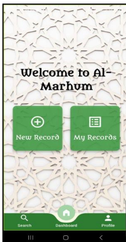
Fig. 1 Welcome Page of Al-Marhum App

The Al-Marhum app's Welcome Page features a clean and appealing design with a patterned background and the warm greeting, "Welcome to Al-Marhum ." It prominently displays two large buttons New Record and My Records, allowing users to add new grave records or view current ones swiftly. The bottom navigation bar allows quick access to the Search, Dashboard, and Profile sections, allowing for effortless moving throughout the program, as shown in Fig. 1.