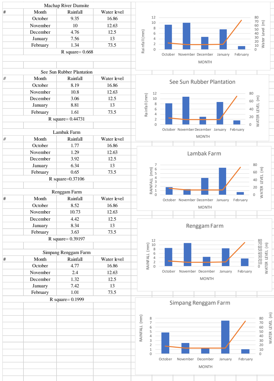
Table 6: Graph of average rainfall and average water level