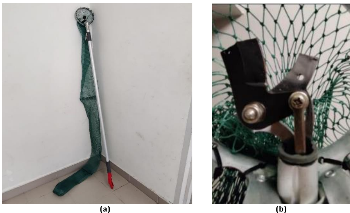
Fig. 3 (a) The rototype of Fruit Picker; (b) Cutter or pruning Shear

Fig. 3(a) shows a prototype of fruit picker, which may look a bit different from the conceptual design shown earlier. The main components are still the same as described before, where this fruit picking tool consists of a telescopic pole, handle lever, cutter, guard and chute. The adjustable telescopic pole can be extended from 1.8 meters to 3 meters. A cutter or pruning shear as shown in Fig. 3(b) is used to trim the fruit stalks that want to be harvested. A guard is used to prevent fruit from falling out of the chute. It also serves as the holder for the chute and cutter. A chute is used to guide and lessen the impacts of the fruit against the ground to preserve the quality of the fruits.