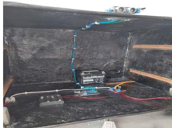
Figure 3: Wiring Installed on RTCV2