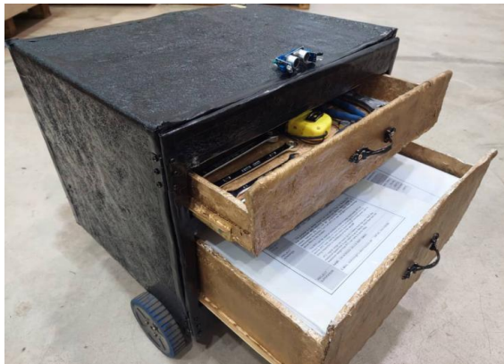
Figure 2: Robotic Tool Cart Version 2 (RTCV2)