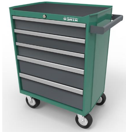
Figure 1: Tool Cart

and equipment keeping device, also as a carrier of the tools and equipment from the tool crib to the workspace, and vice versa. But there is a problem with that, as the user pushes the tool cart to the workspace or to the tool crib, a lot of energy and time is used. So, this is where the Robot Tool Cart Version 2 (RTCV2) came in, the Robot Tool Cart Version 2 was named as it is because a few innovation had been made to the original idea of a tool cart. The Robot Cart Version 2 (RTCV2) was implemented with a self moving device characteristic, thus making it seems like a robot itself. It use Arduino Uno which is also known as a micro-controller, that already comes with the 'follow-me programme' coding that has been uploaded to the Arduino Uno itself. For the coding to work as it is two types of sensor is needed to be applied in this project, which is the Ultrasonic sensor and the Infrared sensor, that is use to detect the distance between the user and the Robot Tool Cart Version 2 itself, and also to detect the proximity of the user path.