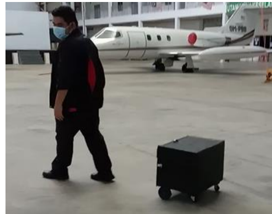
Figure 5 : Testing process of RTCV2