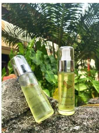
Figure 3: HaniAisyah oil produced from the mixture of coconut oil, soaked rice water and lemon essential oil

Research question 1: Could hair oil from the mixture of coconut oil, soaked rice water and lemon essential oil be made?