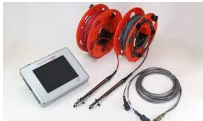
Figure 2: Equipment for CSL test

There are three basic equipment to conduct the CSL test as shown in Figure 2 [15]. First equipment is cross-hole analyzer which is to measure the transmit time of ultrasonic pulses transmitted between pairs of access tubes or sensor installed in parallel holes. The analyzer can calculate the wave velocity