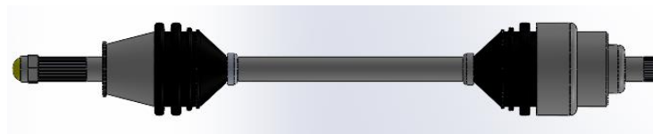
Fig. 2: NCV36579 (GSP) Driveshaft Model in SolidWorks