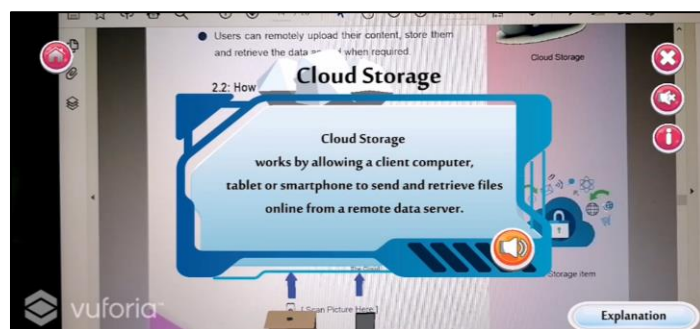
Figure 3: 3D Model in Cloud Storage Subtopic

The implementation phase occurs after the completion of the testing process in the development phase. The developed product will improved as needed and any improvements and errors were repaired based on the feedback of the target users. In this phase as well, users are asked to find bugs and test the functionality of ARStore. Figure 3 shows the explanation panel when user press the explanation button and audio will appear. The user can also mute and unmute the audio.