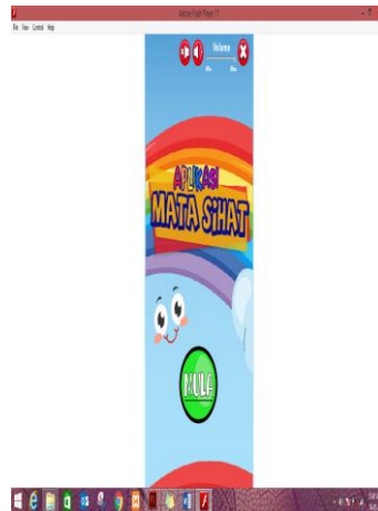
Figure 2: Home screen design interface

In every development that needs to be developed, there should be a key point for the user to begin development. In this eye care app for children developers have developed a great look for users who are ready to start using this app as shown in figure 2.