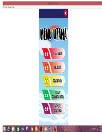
Figure 3: Home menu screen interface