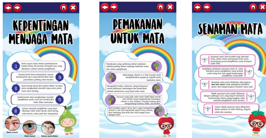
Figure 5: Note introduction screen for eye care in children, healthy nutrition for the eyes, and eye exercises