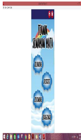
Figure 7: Screen menu for eye exercise