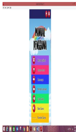
Figure 9: User manual screen interface