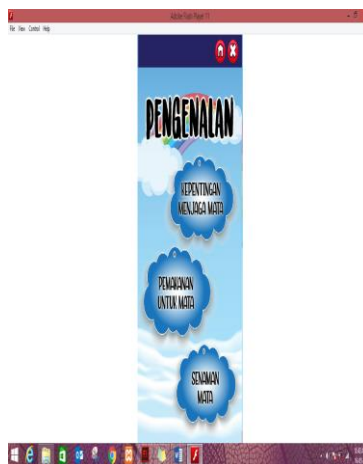
Figure 4: Introduction screen interface

On the introduction screen, the developer places three navigation buttons on childcare. These include information on eye care in children, healthy nutrition for the eyes, and eye exercises. An introduction is placed at the beginning of the application to give the user an understanding of the purpose of the application being developed. Figure 4 shows the introduction screen.