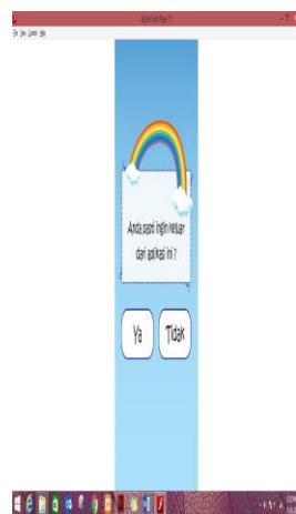
Figure 10: Exit screen interface

An exit screen is developed to tell users whether or not they want to leave this application when they press the 'exit' button on each screen. This view is the text in question. If a user wants to sign out of this app, they will need to hit the 'Yes' icon button and press the 'No' icon to remain on the app. Figure 10.0 shows the exit screen interface.