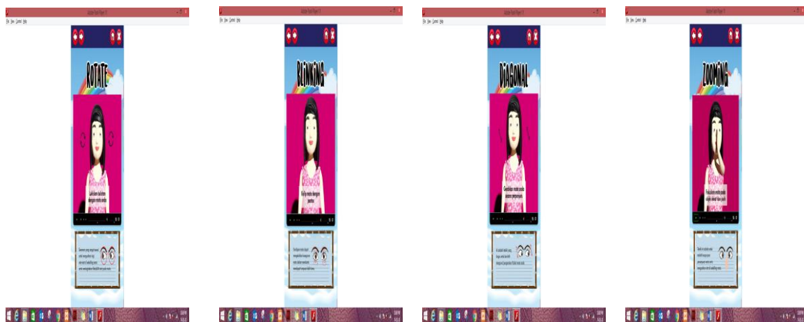
Figure 8 Video eye exercise tutorial interface

On the screen of eye-catching techniques, developers put 3D animated videos on eye-catching techniques. This eye-catching technique video developed in 3D is for users to better understand the technique of eye exercises correctly. Figure 8 shows video tutorial eye exercise screen interface.