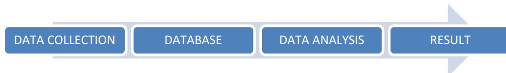
Figure 1: The flow processes

The expectation for this study is to analyze the best chemical additive that can be used in the stabilization of the soil to avoid failure in the foundation. Based on the specification, the soil with the suitable shear strength can be chosen.