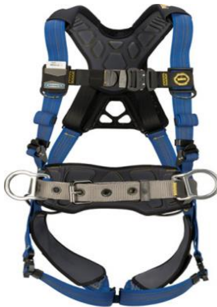
Figure 2.2 Full body harness with back attachment [19]